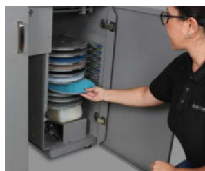
Grinding/Polishing Disc Storage for Automatic Disc Replacement

VELOX 102 is equipped with automatic peristaltic dosing system with 8 peristaltic pumps [ 6 for diamond suspensions/lubricant and 2 for aluminum oxide suspensions]. The automatic peristaltic dosing system is used in combination to obtain consistent specimens and to save time and consumables. Both diamond suspensions/lubricants and aluminum oxide suspensions can be fed. Dispensing parameters like; frequency, fluid selection etc. are controlled through the LCD screen of the VELOX 102. High quality peristaltic pumps guarantee exactly the same dosing every time. Pre-dosing function lubricates the polishing cloth before each operation to increase the life of polishing cloth and obtain perfectly polished specimen surfaces. The suspensions and lubricants that are remained in the dosing tubes retract back at the end of every step to eliminate the risk of contamination from coarse abrasive on a finer grain size with auto retract function. Automatic Liquid Level Calculation of suspensions and lubricants is also available and can be monitored through the LCD screen of the VELOX 102. The calibration can be carried out when a lubricant or suspension is filled. The operator will be informed to refill the bottle when the suspension/lubricant level is below the critical value. All bottles have a magnetic stirrer inside to prevent sedimentation of suspensions and make more homogenous abrasive distribution inside the suspension.