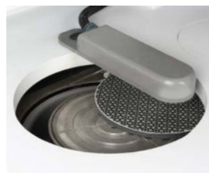
Automatic Disc Replacement Unit