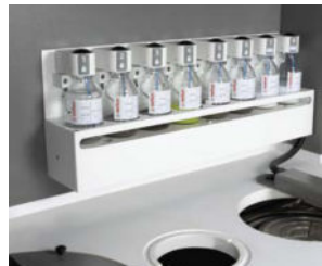
Automatic Fluid Dispenser