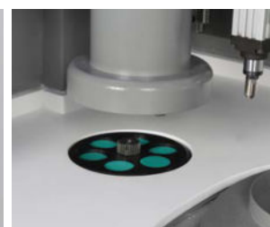
Automatic Sample Holder Replacement Unit