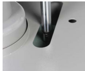
Automatic Dressing Unit

ENVIRO Filter Unit is a closed loop recirculating filter system which can be used for grinding/polishing station of VELOX 102. It has a 20 lt reservoir capacity with 1 micron filter. It filters and cleans the drain water which comes from grinding/polishing station and pumps it back to grinding/polishing station for cooling. It saves water while grinding. It is optional accessory of VELOX 102 and can be placed inside the cabinet.