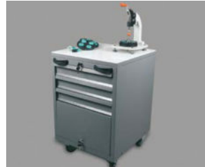
Stand For Levomat