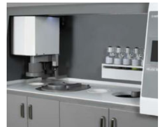
Operator-Free Sample Preparation