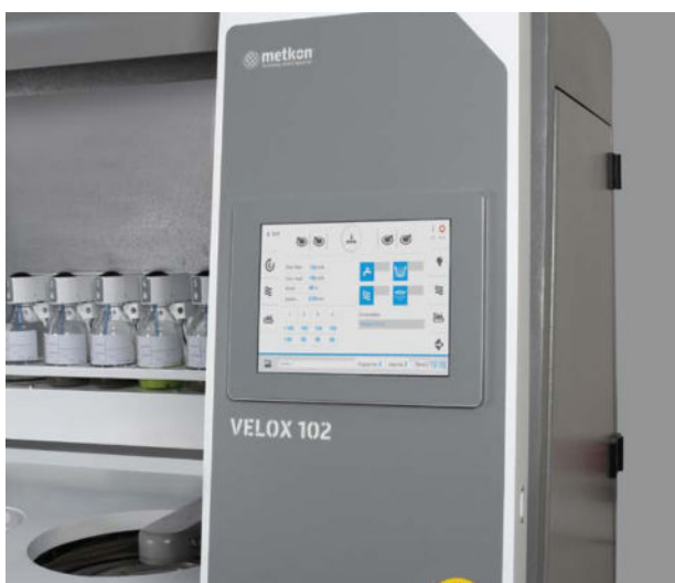
Programmable HMI touch screen controls