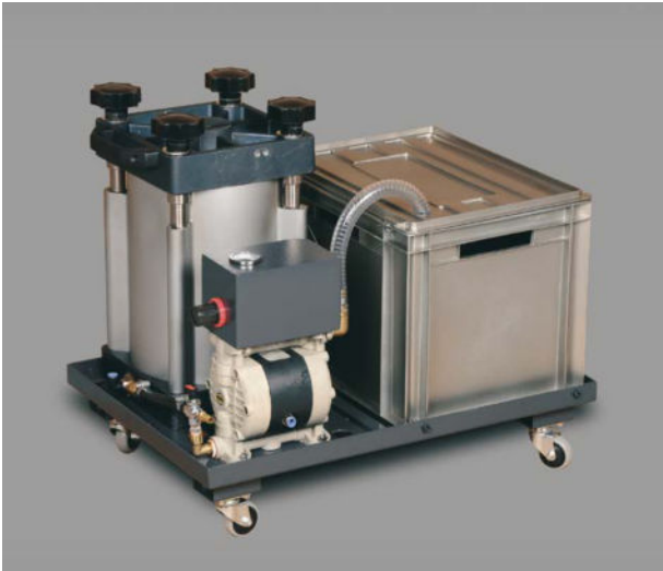
Enviro recirculating filtering unit